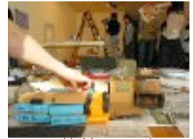
stockbridge to scale

The complex interplay of community and space operates in both form and imagination. A significant component of the studio's work engages these interactions with projects that project ideas and plastic forms. Displacement followed the Placement project in conceptual and actual propositions for the spaces now occupied by the highways and industrial corridors. In the project Stockbridge to Scale an open invitation was distributed to friends and neighbors to participate in the construction of a scale model of a 4 square block area. The model was constructed using discarded material collected from that area.