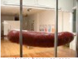
welcome happy sausage

One of the most significant things that happens in the studio are intense and ongoing discussions about what we are doing. When engaged in situated practice everything is contingent on other things. Theoretical thinking and discussion are embedded in persistent experiences. Imagined and implemented actions are understood as consequential.