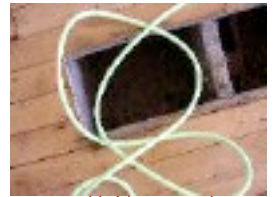
stockbridge to scale

The civic studio is a project of the department of art and design at Grand Valley State University in Allendale, Michigan. The project is supported by the Dorothy Johnson Center for Philanthropy at GVSU.