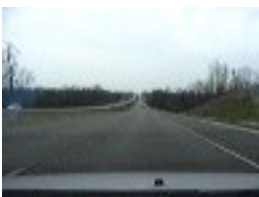
campus drive to bridge st.

Finally, the focus of some of the projects has been critical reflection on our engagement and activity. In the projected video Campus Drive to Bridge Street a studio member made a visual record of her drive from the parking lot of the rural University campus through the farmland, over the river, through the strip mall suburb, down the hill to the city which gradually gets more dense and varied. Destocktion is a companion piece to Stockbridge to Scale in which a studio member goes on a rampage destroying the model neighborhood. Using whatever he could find to wield power, he stomped and kicked, threw bricks and shoes, and swung a large cardboard tube in a frenzy of frustrated destruction. The performance resulted in a video piece with sound from the Supermario brothers video game.