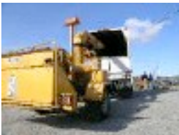
Department of Forestry

• Local Methodologies involved the investigation of local knowledge. The project was a reaction to our inclination to think that our role should be to bring knowledge to an area when it was much more valuable to reverse the roles and look for unique things we could learn. What resources and special knowledge was there? The focus narrowed to things one could make and do by hand. Five local methods of hand formed enterprise are documented in instructional posters.