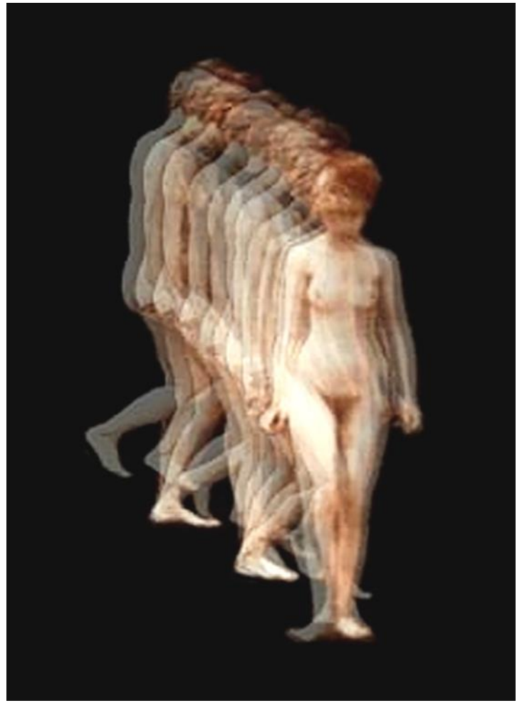
Figure 2: Woman Descending Stairs and Turning Around. Photographic sequence by Eadweard Muybridge, 1887.

Duchamp's painting Nu descendant un escalier (Fig. 3), or Nude Descending a Staircase , depicts a female figure in motion. It is created in the cubist mode of deconstruction of form in the sense that it does not resemble an anatomical nude, but only presents abstract lines and planes instead. These lines suggest the successive static positions of the body and thus create a sense of motion. But the motion and the female nude occur only in the mind of the viewer.