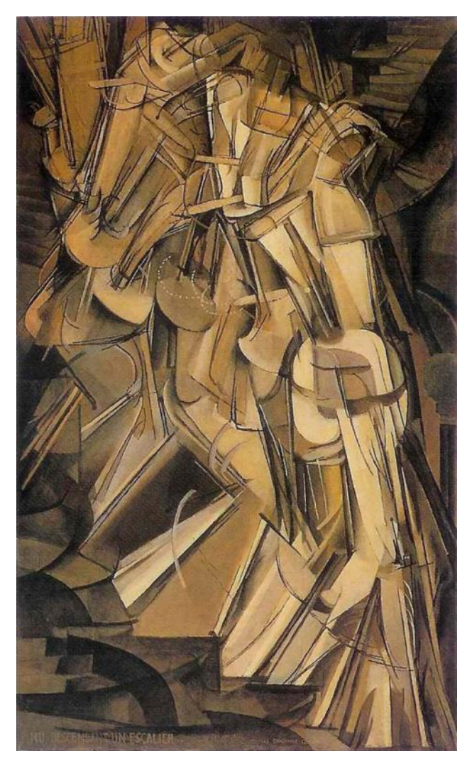
Figure 3: Marcel Duchamp, Nude Descending a Staircase (1912)

Just like Duchamp, Cummings intended the three deranged images of the grasshopper to create a sense of motion in the mind of the reader. There is a difference, however. While Duchamp's superimposed images imply sequential movement in a spatial dimension, Cummings' metamorphosed images of the grasshopper, with their increasing degree of abstraction, suggest also a qualitative change in temporal dimension.