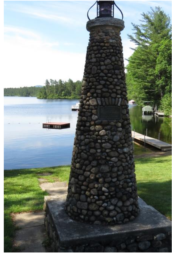
The Memorial Light

The Memorial Light is located at the head of Silver Lake. Estlin Cummings enjoyed the view across the Lake while waiting for Marion Morehouse to shop at Gilman's store or pick up their mail from the Depot across the street. The stone pillar was built in part to honor Cummings' father who developed the eastern shore of Silver Lake. The Cummings' place on the lake, "Abenaki," built c. 1910-1911, is best seen by boat.