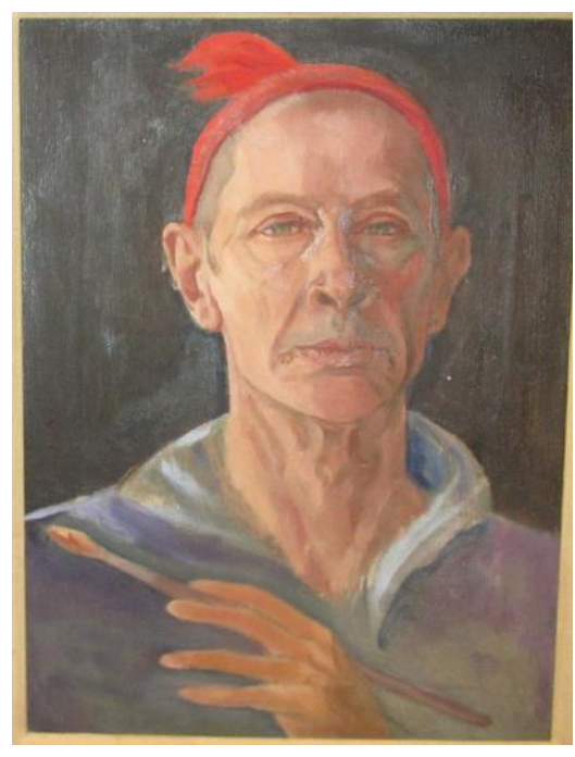
Figure 2: Self-Portrait in a Red Hat

Also for sale online (on E-Bay) and also courtesy of Steven, is this rather good (circa 1958) self-portrait (fig. 2).